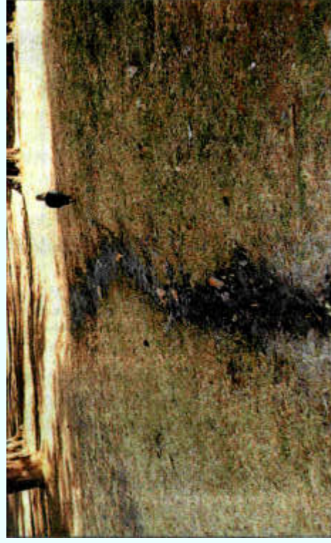
A hadeda waddles near a stream of dirty bathwater from the illegally occupied clubhouse.